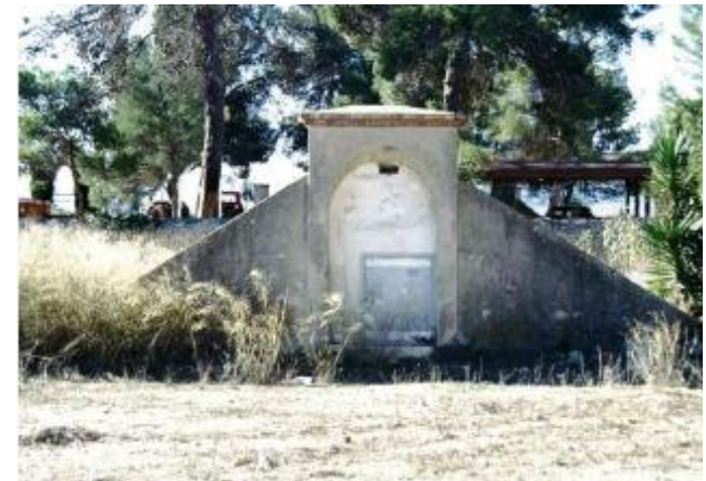
Villa 'El Poblet', in Petrer, last residence of the president Juan Negrín in Spain; and air-raid shelter in the Monovar place known as 'El Fondó'.