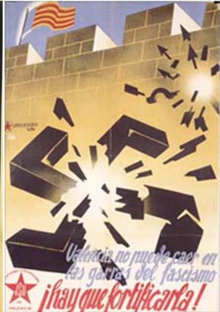
Wartime propaganda summoning to enlist to construct the El Puig – Cara-sols Line.