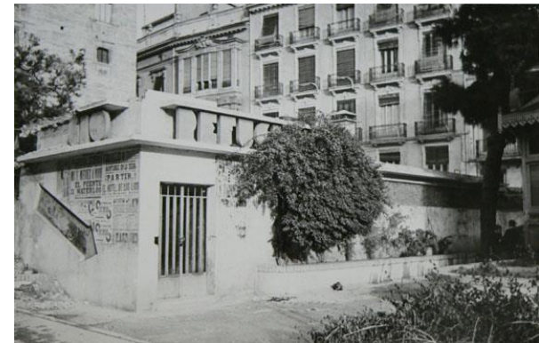
Air-raid shelters in Valencia's Plaza del Patriarca and Plaza de la Virgen, now gone