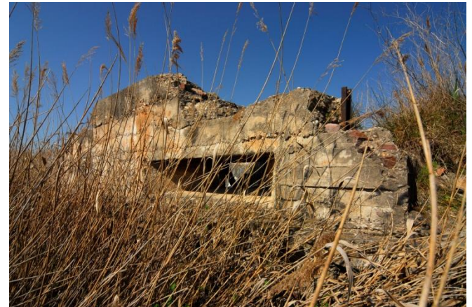
Several elements of El Puig – Cara-sols Line as they are preserved at present.