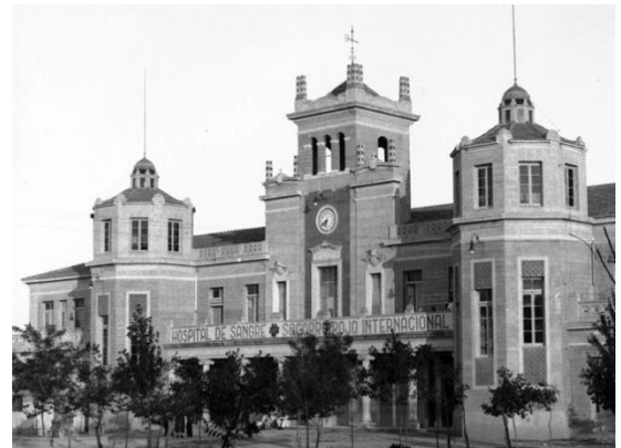
The current garden of the Music, in Elda, acted as war hospital for the International Brigades. Below, the war hospital of the Socorro Rojo Internacional in Monovar.