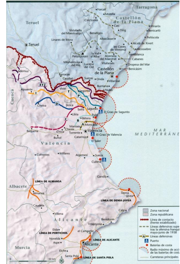
Several defensive lines constructed in Valencia region during the Spanish Civil War

Nowadays, a great amount of remnants of the fortifications of the XYZ Line still survive in different degrees of preservation.