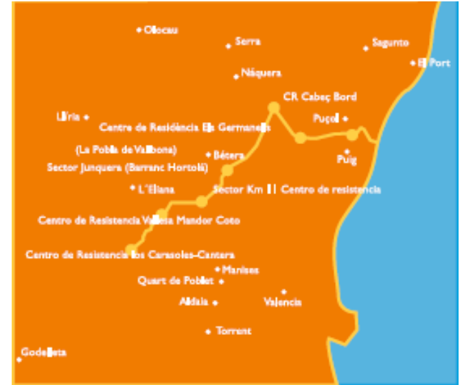
Approximate delineation of El Puig – Cara-sols Line.

The cultural value of these remnants could be incorporated into the natural values of the landscape where they lie along the route of the Line.